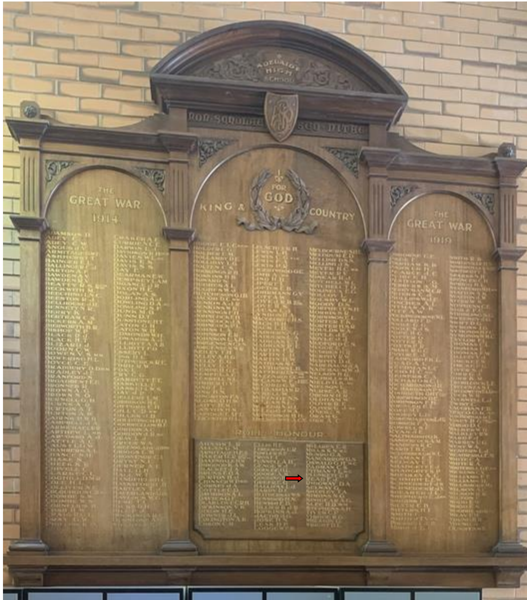
Adelaide High School Honour Board