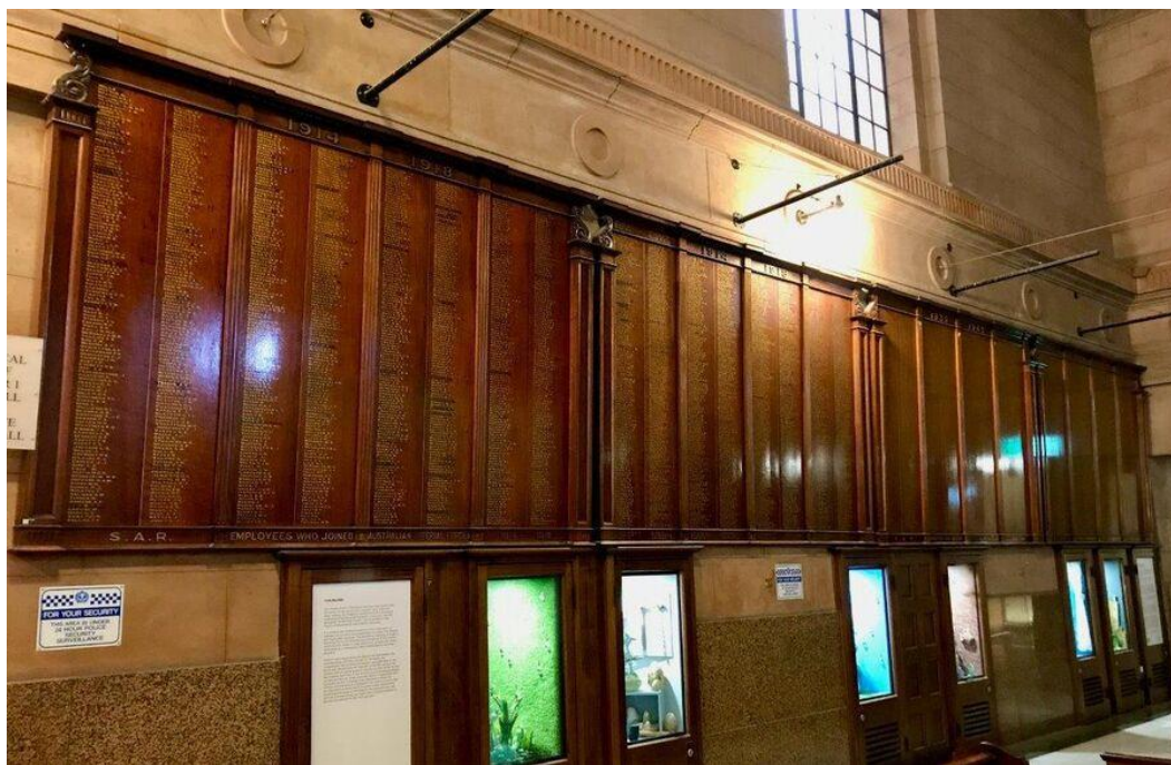
South Australian Railways Honour Roll

F. J. Read is remembered on the South Australian Railways Honour Roll, located in Station Arcade, Adelaide Railway Station, North Terrace, Adelaide, South Australia.